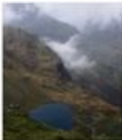
Increased heavy rain in the uplands causes the risk of flooding in lowlying locations.

Professor Shuttle expressed that an inch or less of rainfall over the course of a day, spread over a large catchment area, had the potential to result in a variable flood in low lying areas where run-off from the uplands had accumulated in local river systems.