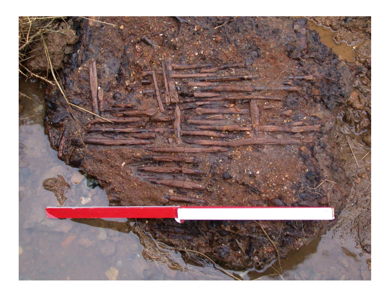
Coppiced hazel walkway in the Isle of Wight – 2800 BCE We have been coppicing a long time!