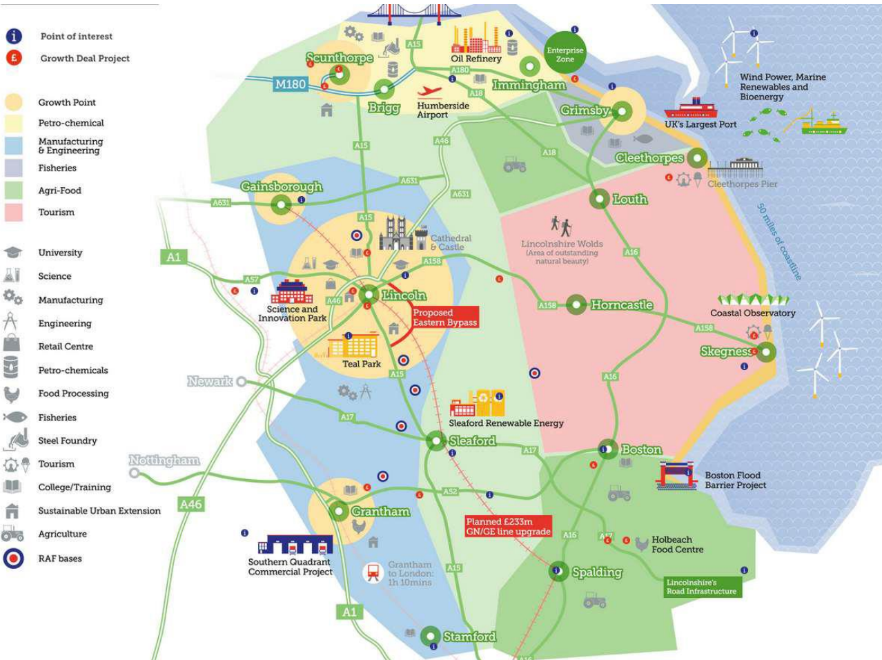
Graphic courtesy of GLLEP